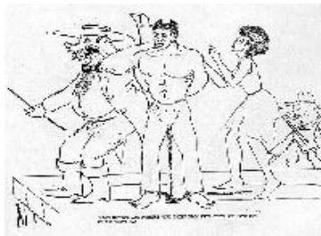
Click for full size picture. (12K)